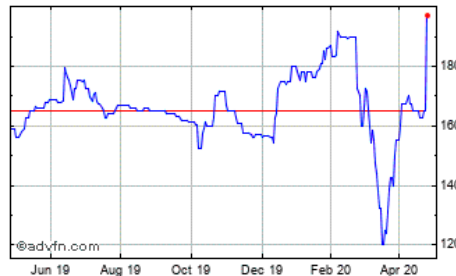
1 Year Nwf Chart